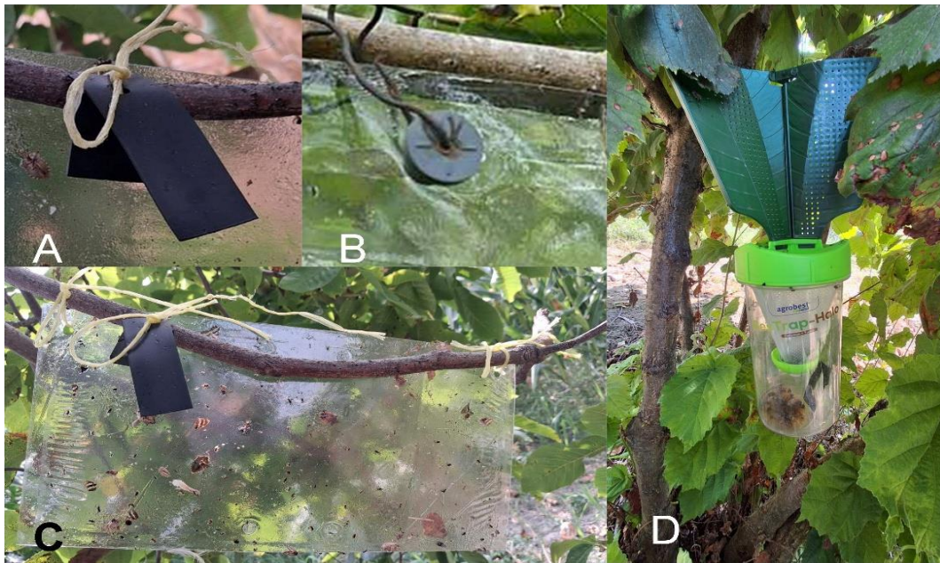
Fig. 1. Pheromone and Trap types: A – TRECE; B – AGROBEST; C – Sticky; D – Rocket type.