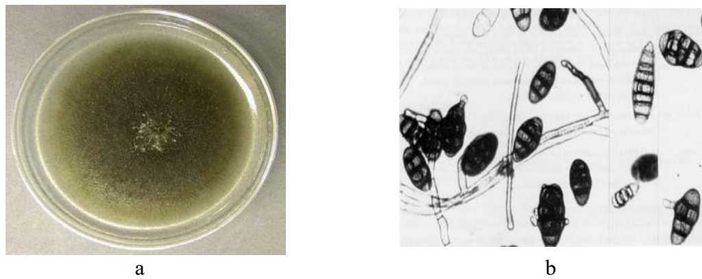
Fig. 1. Colonies (a) and conidia (b) of Alternaria