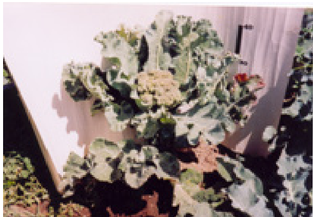
Fig.3. Cabbage variety Gnome

Studies of yield data showed that treatment with a biological product contributed to the formation of the highest yield in the Gnome variety - 298.3 c / ha (Figure 3), while in the control it was 278.3 c / ha. The smallest yield was noted for the variety Christmas from Calabria - 268.4 c / ha, compared to the control 248.7 c / ha.