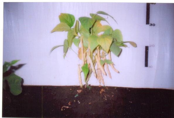
Fig. 2. Beans of the Saksa variety without fiber 615

was formed in the Laura variety (15.9 pieces), the minimum was in the Saksa variety without fiber 615 - 10.5 pieces. (Figure 2).